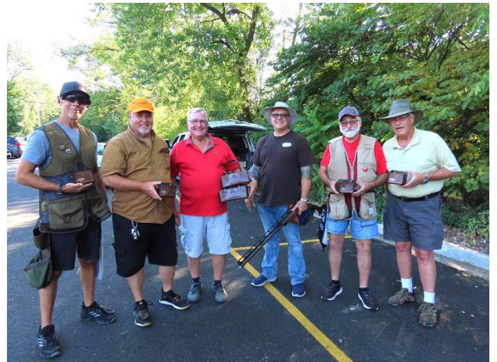
ATA Trap Day Winners